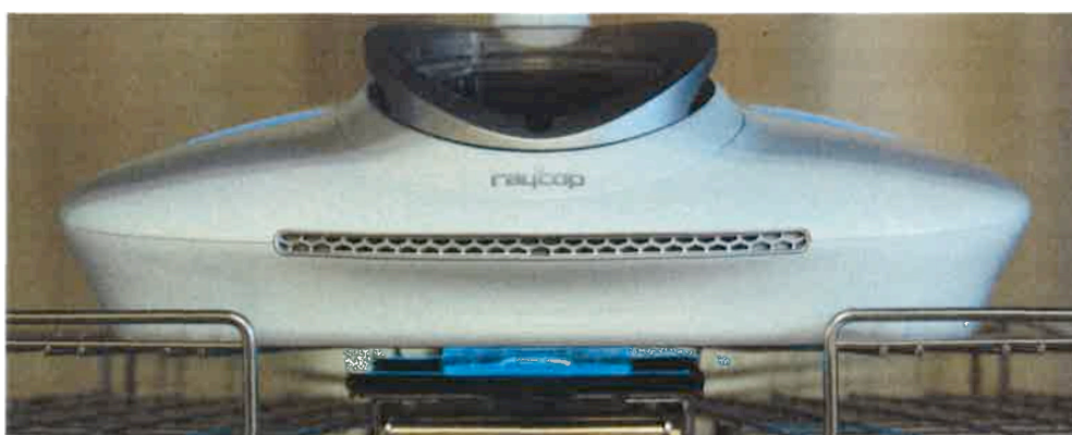
Picture 2. Appearance of UV irradiation