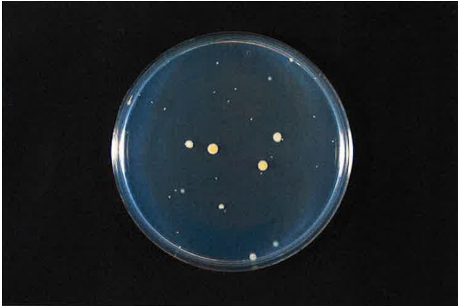
Photo 7 Staphylococcus aureus

After exposure to the test object approximately 5 seconds (washing fluid 1 mL)