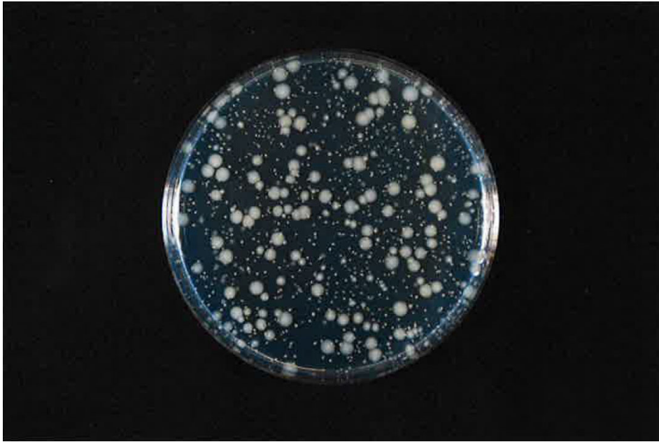
Photo 3 Escherichia coli

After exposure to the test object approximately 5 seconds (washing fluid 1 mL)