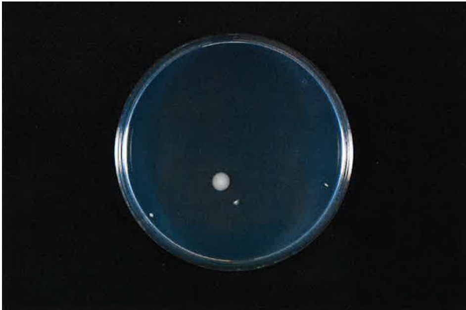
Photo 4 Escherichia coli

After exposure to the test object approximately 5 seconds (washing fluid 1 mL)