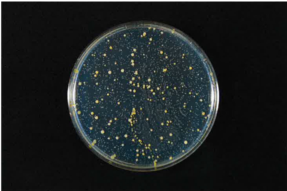
Photo 6 Staphylococcus aureus After exposure to the test object approximately 2 seconds (washing fluid 1 mL)