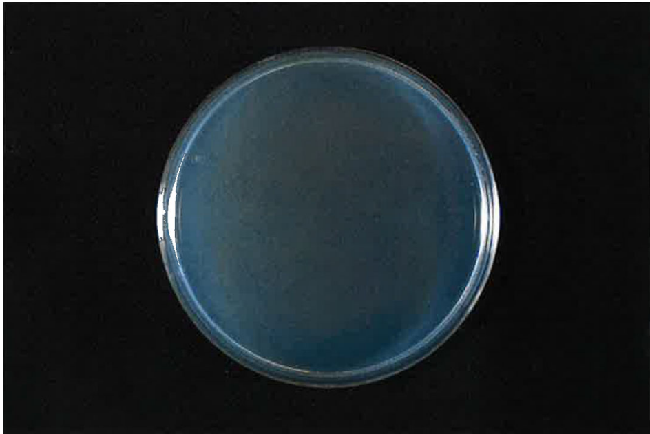
Photo 8 Staphylococcus aureus

After exposure to the test object approximately 5 seconds (washing fluid 1 mL)