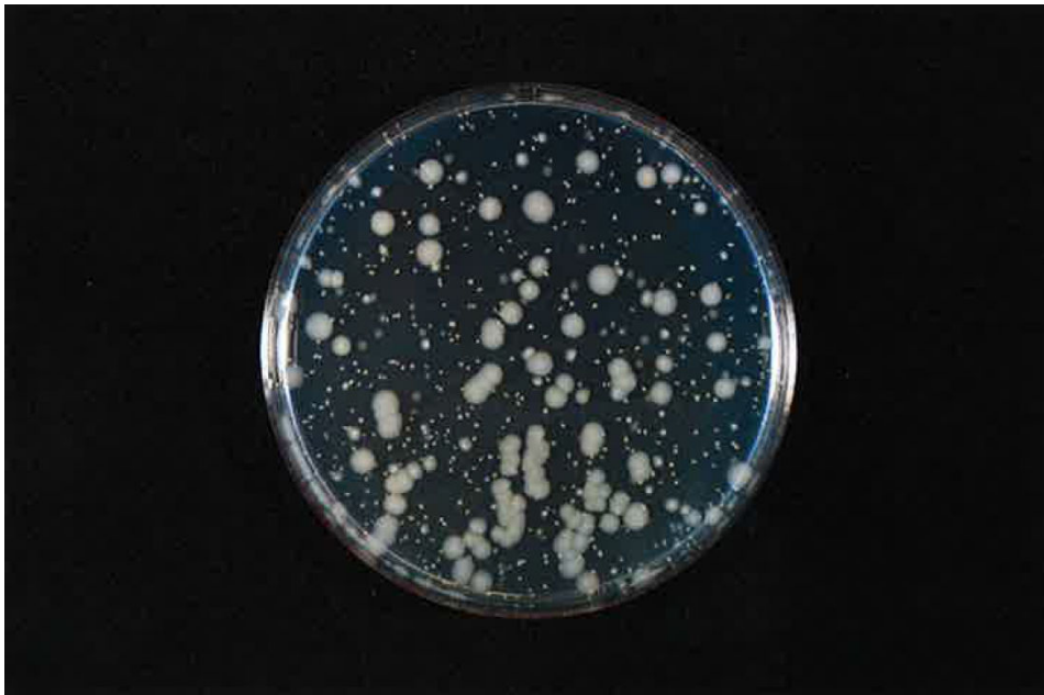
Photo 2 Escherichia coli After exposure to the test object approximately 2 seconds (washing fluid 1 mL)