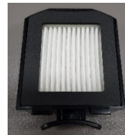
<HEPA Filter (13 degree) >