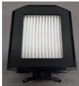
< HEPA Filter>