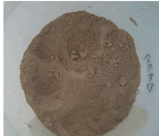
< Dust for Test Use>