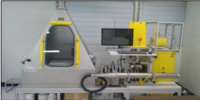
TOPAD Dust Emission Tester