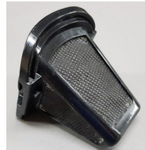
<Fabric Filter >