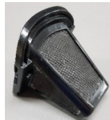
< Fabric Filter >