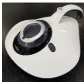
< Lite(RE) MAIN BODY >