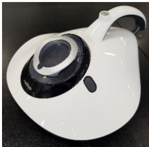
< Lite(RE) MAIN