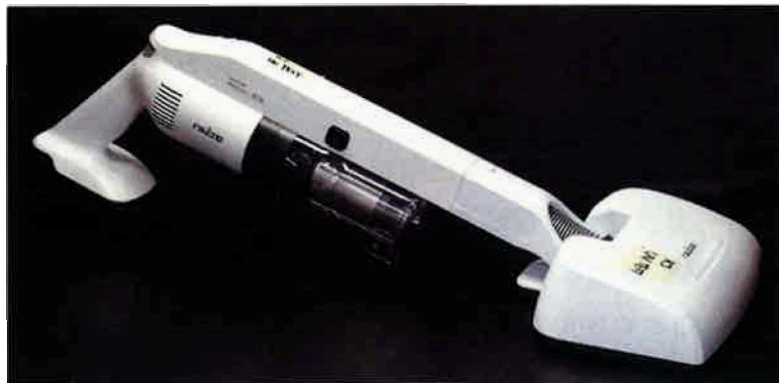
Figure 1. Specimen