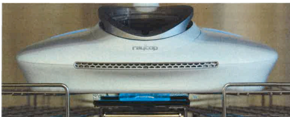
Picture 2. Appearance of UV irradiation